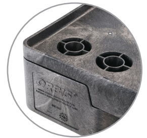
1" Height continuous lip